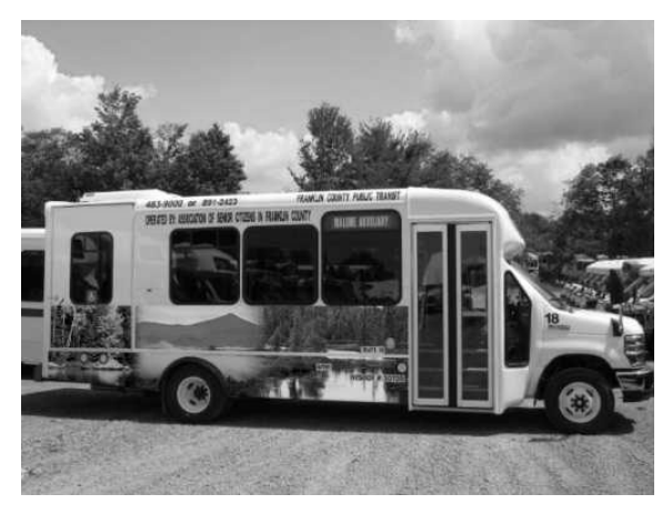
Franklin County Transportation

All riders must wear a mask. NO EXCEPTIONS.