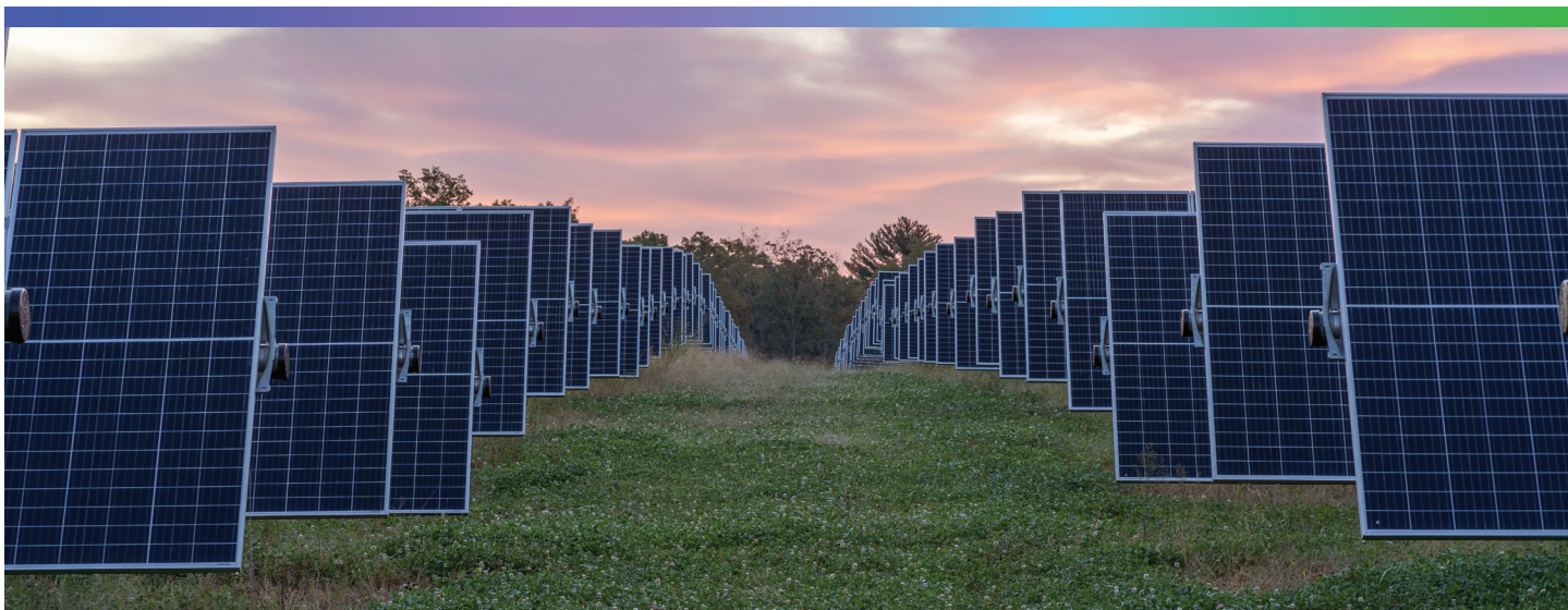
AES' Spotsylvania Solar Energy Center, Virginia