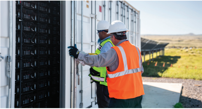
AES' Waikoloa solar-plus-storage project, Hawai'i