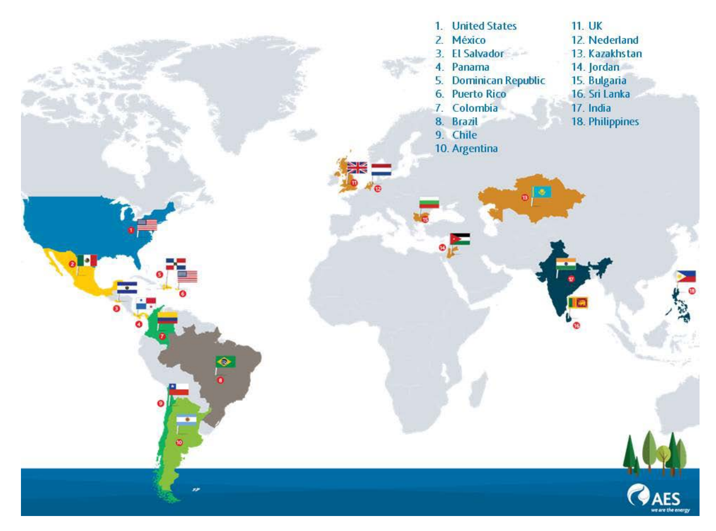
Figure 1 - Countries were AES has presence

By the end of 2014, AES had presence in 18 countries across the globe.